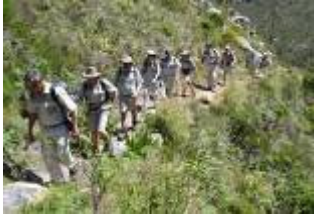
HR's en route to the top of Table Mountain

It is time for the highlight of the iKapa social calendar. The annual Table Top Weekend. This event has become a much looked forward to function. The HRs who attend will meet near Constantia Nek on Saturday Sept 20 and walk up the back table via Orangekloof, one of the most scenic walks up the mountain. Aply led by Claude the group will pass by some historic sites such as the original tunnel built to funnel water down to the city from the dams at the top. Claude will enthrall the group with stories about the building of the dams in the 19 th century. A visit to the museum is also part of the agenda. Overnight will be spent in the hut near the dams. On Sunday after exploring the back table you will return to Constantia Nek via the Jeep track.