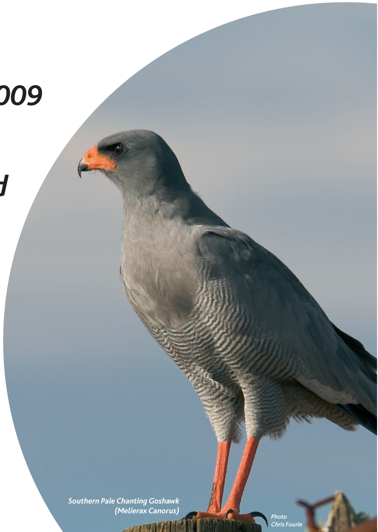
Southern Pale Chanting Goshawk ( Melierax Canorus )

Please book early to avoid disappointment